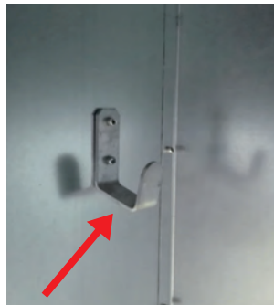
Inner suspension eye